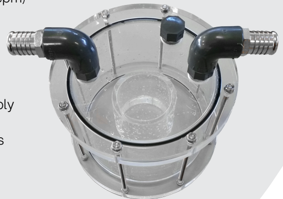
LEM Marinelli beaker with fittings

(*) If not available in the sampling/hydraulic equipment which LEM shall be connected to