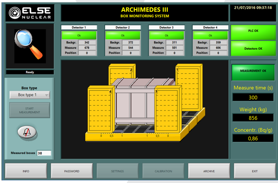
ARCHIMEDES III software interface